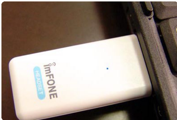
<Part no.: imFONE_HS>