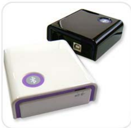
<Part no.: STAP-100>

Dimensions : 50mm*90mm*18mm, Weight : App. 100g