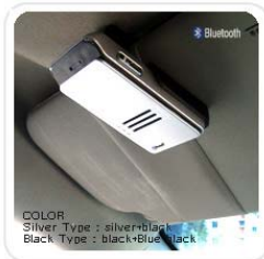
<Part no.: BHF-100>