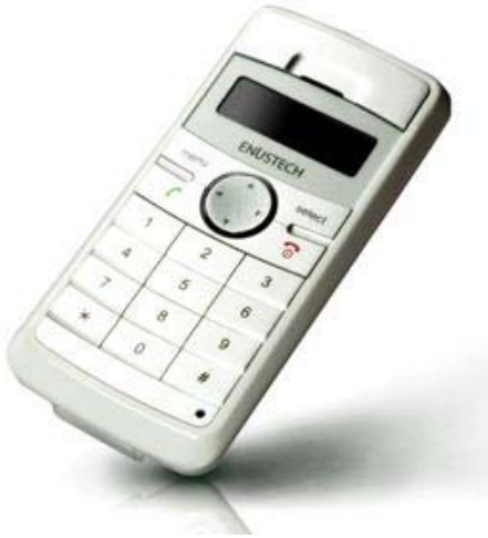
<Part no.: imFONE_CP>